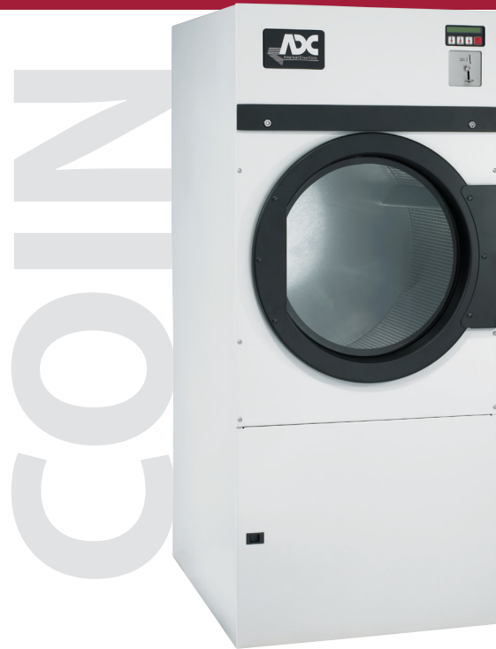
AD-24 Coin Dryer