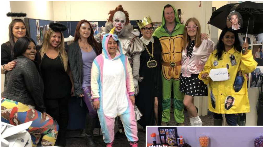
Hercules celebrated a wild Halloween with prizes for most original and scariest costume, followed by an office luncheon.